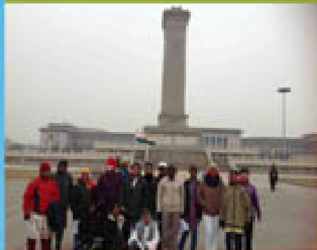
Parliament of China